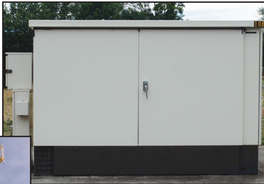
Typical Wireline Application