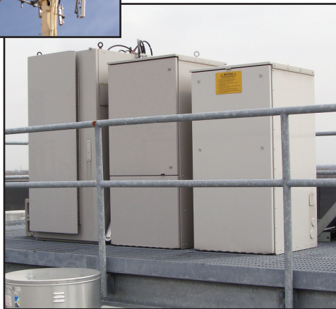
Typical Wireless Application